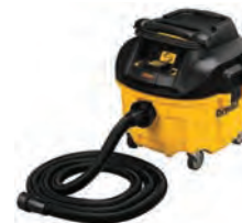
8 Gal Wet/Dry HEPA/RRP Dust Extractor #DWV010