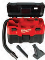
M18™ 2 Gal Wet/Dry Vacuum Kit (Tool-Only) #0880-20