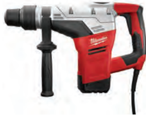
1-9/16" SDS Max Rotary Hammer Kit w/Case