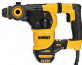
1-1/8" SDS Plus Rotary Hammer Kit w/ Case