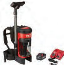
M18™ FUEL™ 1 Gal 3-in-1 Backpack Vacuum Kit #0885-21