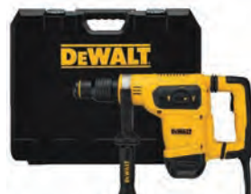
1-9/16" SDS Max Combination Rotary Hammer Kit