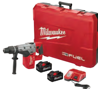
M18 FUEL™ 1-9/16" SDS Max Rotary Hammer Kit