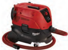
8 Gallon Dust Extractor #8960-20