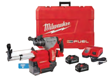
M18 FUEL™ 1-1/8" SDS Plus Rotary Hammer w/ ONE-KEY™ & HAMMERVAC™ Dedicated Dust Extractor Kit