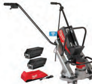
MX FUEL™ Vibratory Screed kit #MXF381-2CP