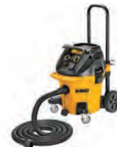
10 Gal Wet/Dry HEPA/RRP Dust Extractor #DWV012