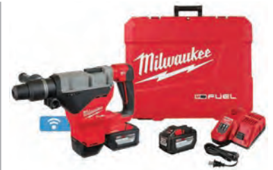
M18 FUEL™ 1-3/4" SDS Max Rotary Hammer Kit