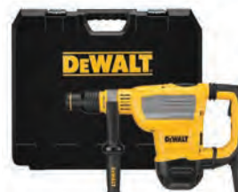
1-3/4" SDS Max Combination Hammer Kit