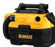
2 Gal 20V MAX* Cordless / Corded Wet-Dry Vacuum (Tool Only) #DCV581H