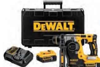
20V MAX* 1" XR®x Brushless Cordless SDS Plus L-Shape Rotary Hammer Kit