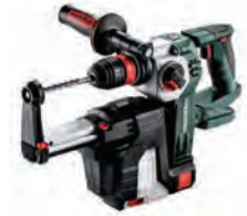
18V Cordless Rotary Hammer SDS Plus with Integrated Dust Collection and HEPA Filter w/ Case