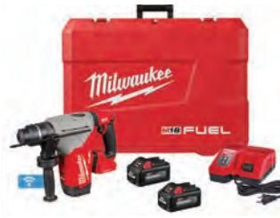
M18 FUEL™ 1-1/8" SDS Plus Rotary Hammer Kit