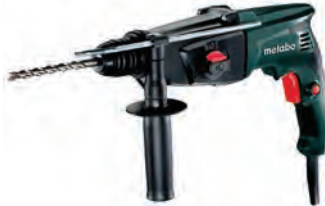
1" SDS Plus Combination Rotary Hammer Kit w/ Case