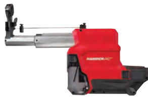
M18 FUEL™ HAMMERVAC™ 1-1/8" Dedicated Dust Extractor #2915-DE