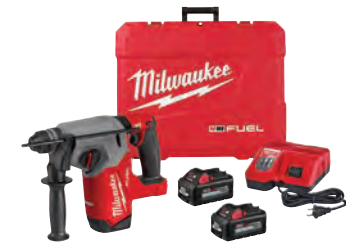
M18 FUEL™ 1" SDS Plus Rotary Hammer Kit