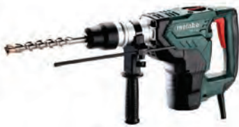
1-9/16" SDS Max Combination Hammer Kit w/ Case