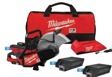
MX FUEL™ 14" Cut-Off Saw Kit #MXF314-2XC