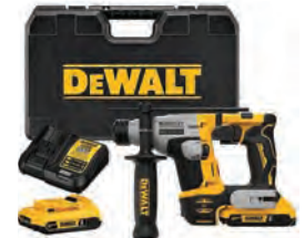
ATOMIC 20V MAX* 5/8" Brushless Cordless SDS Plus Rotary Hammer Kit