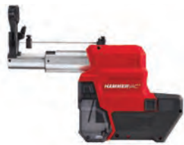
M18 FUEL™ HAMMERVAC™ 1" Dedicated Dust Extractor #2912-DE