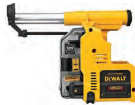
Onboard Dust Extractor for 1" SDS Plus Hammers #DWH3030DH