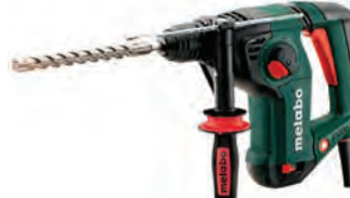
1-1/4" SDS Plus Combination Hammer Kit w/ Case