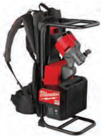
MX FUEL™ Backpack Concrete Vibrator w/ backpack harness #MXF371-2XC