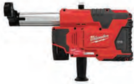
M12™ HAMMERVAC™ Universal Dust Extractor #2306-22