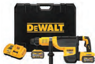
60V MAX* 2" Brushless Cordless SDS MAX Combination Rotary Hammer Kit