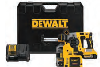
20V MAX* XR® Brushless 1" L-Shape SDS Plus Rotary Hammer Kit with On Board Dust Extractor