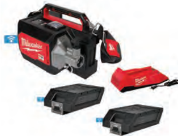
MX FUEL™ Concrete Vibrator Kit #MXF370-2XC