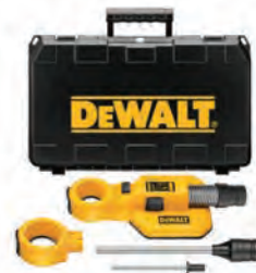
Large Hammer Dust Extractor Kit #DWH050K