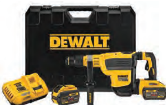
60V MAX* 1-3/4" Brushless Cordless SDS MAX Combination Rotary Hammer Kit