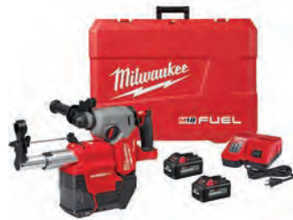
M18 FUEL™ 1" SDS Plus Rotary Hammer w/ Dust Extractor Kit